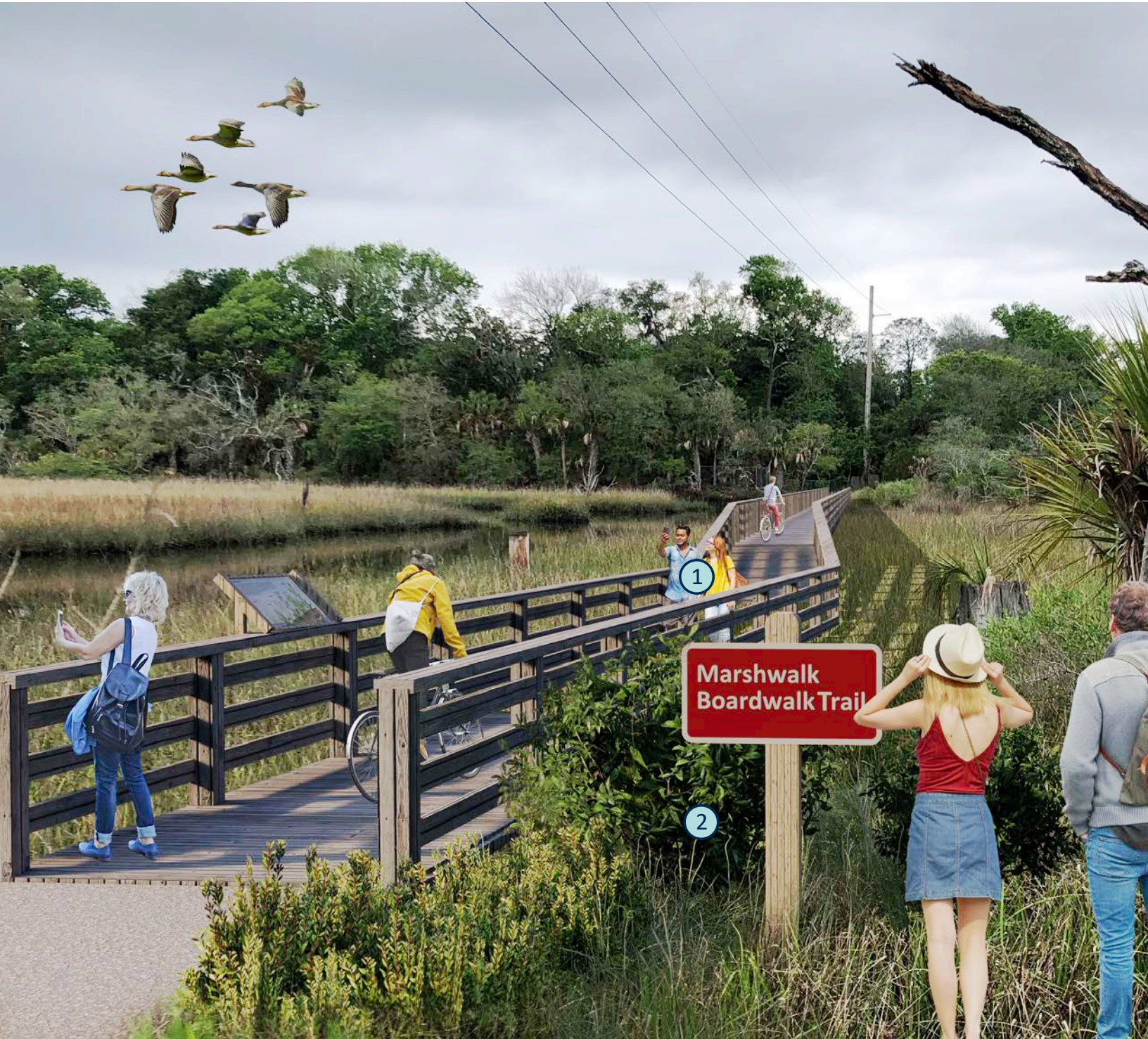
Figure 4.41: Seagate Avenue Bridge Connection