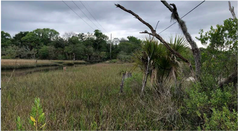
Figure 4.42: Seagate Avenue- Existing Condition